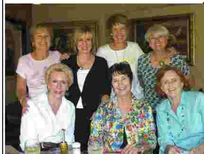
Ladies who lunch...

On the Tuesday after the Reunion, these seven ladies met for a lovely luncheon in the quaint Village of Long Grove, IL.